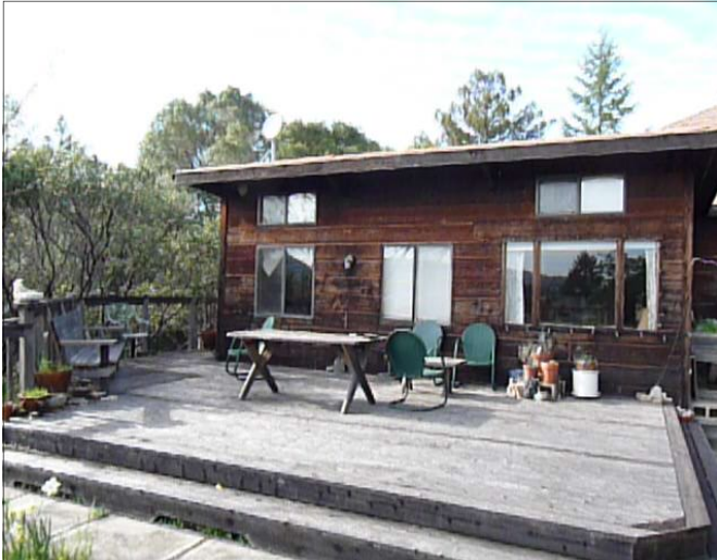
BIG SOUTH FACING DECK