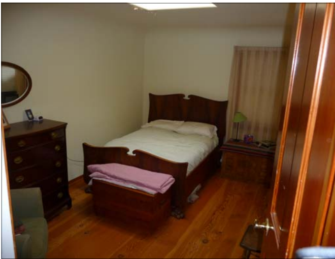
GUEST ROOM WITH SKYLIGHT & MILLED FIR FLOORS