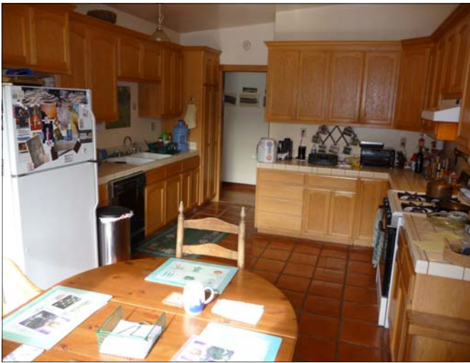
BIG OPEN KITCHEN W/ TILE FLOORS