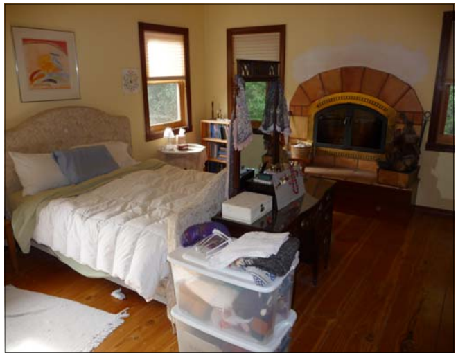
MASTER BEDROOM WITH FIREPLACE