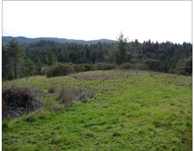
LOTS OF OPEN ROLLING HILL TOP