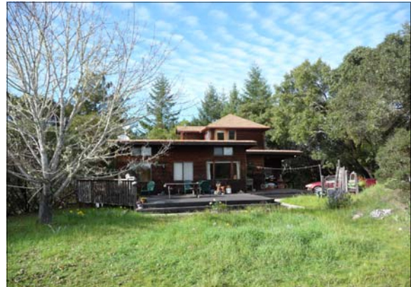
HOME NESTLED BETWEEN WOODS TO NORTH, MEADOWS TO SOUTH