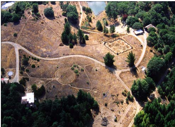
ARIEL PHOTO SHOWING LABYRINTHS