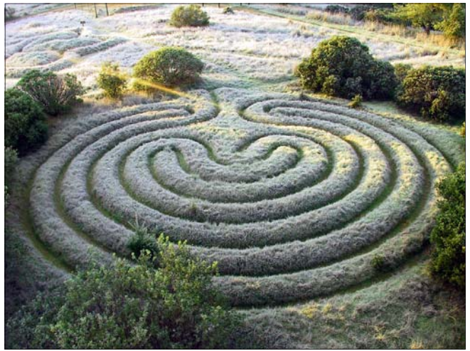
ONE OF MANY LABYRINTHS ON PROPERTY BUILT BY FAMOUS LABYRINTH MAKER